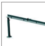
UHG 14 + UHG 14 ext Hose-guide