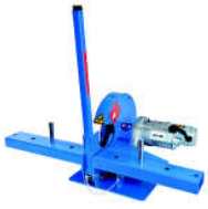
EM 6 DC