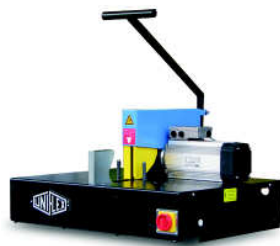
EM 8 M