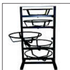
USH 4 + 513.1 Hose rack