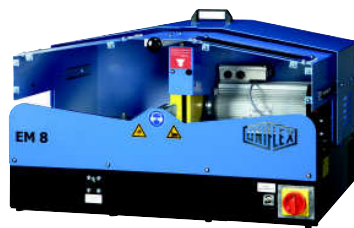
EM 8 P