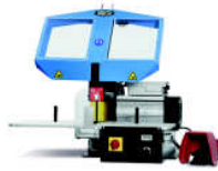
EM 6 P