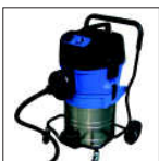
UVC Suction device