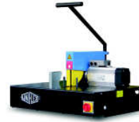
EM 8 M