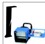
UMS 4 + 514.1 Measuring device