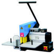
EM 6 M