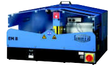
EM 8 P