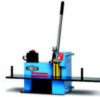
EM 6 Ecoline