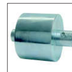
330.1 Spark arrester