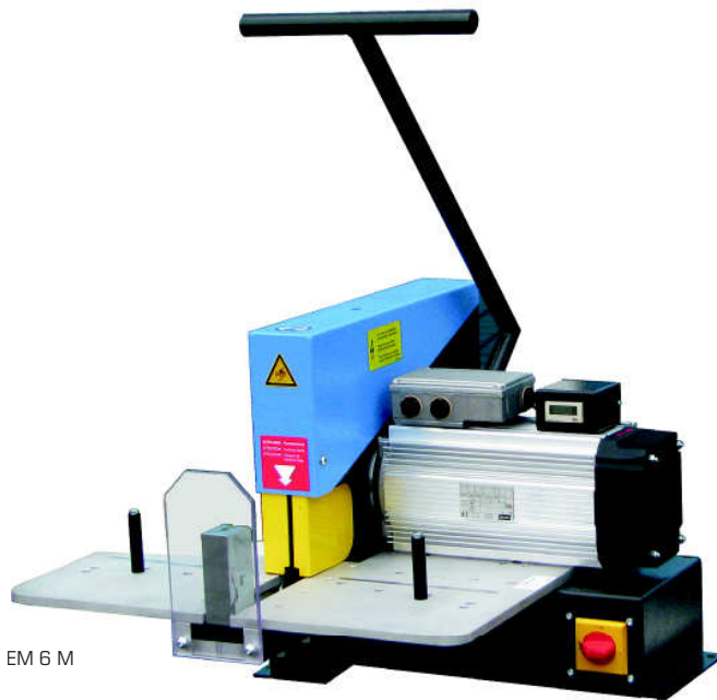
EM 6 M

UNIFLEX hose cutting machines have been a synonym for the highest precision and robustness for many decades. The solid and compact tools distinguish themselves by their safe and high-quality cutting function. A distinct property is the positioning of the extraordinarily sharp cutting blades close to the powerful motors. This significantly reduces vibration – which is one of the reasons for extreme durability and low maintenance costs.