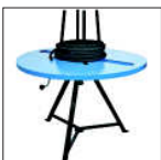
UAT 4 Coiler