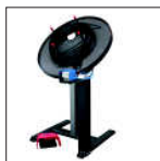
Hose coiling reel UWT 2 + Hose measuring tool UMS 4